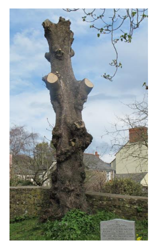
[The rather sad looking pollarded chestnut. We aim to add another picture of the tree when in full leaf!]

A grant of £330 was given by FoStA to cover the costs.