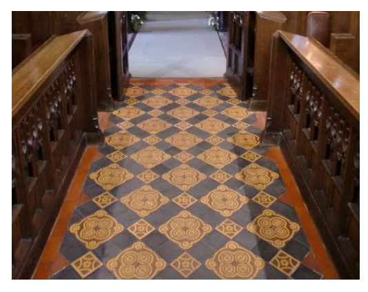
[The recently revealed tiles between the choir stalls]

The removal of the very worn and dirty Chancel carpet revealed such attractive & well preserved tiles that after they had been cleaned it was decided, by the PCC, not to replace the carpet at all.