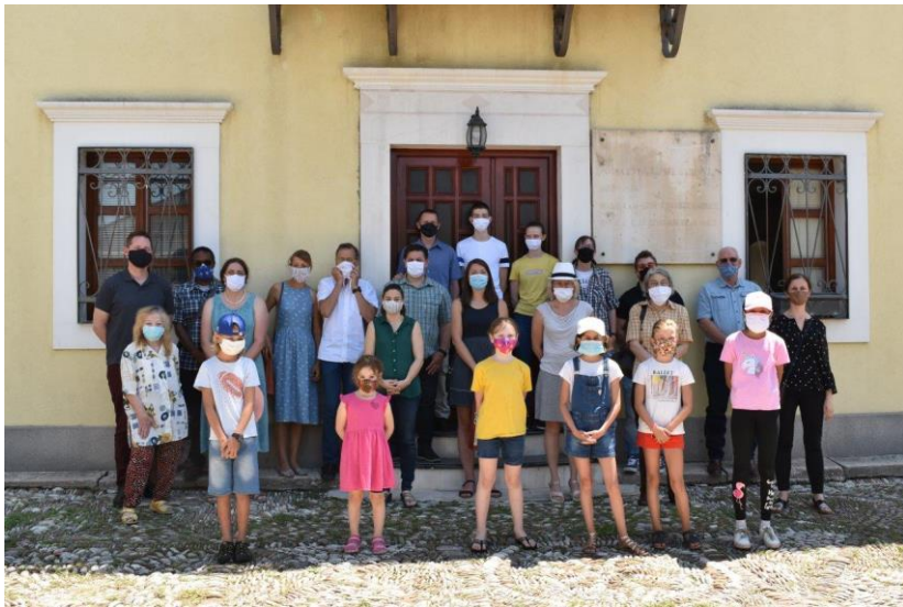
After church one Sunday

These last eighteen months have been both difficult and strange, throughout the world. However, I think the experience has varied greatly in different parts of the world, due not just to the severity of the pandemic, but also to the response of the governing authorities, and the population in general. As a Brit living in Mostar, Bosnia Herzegovina (part of the former Yugoslavia, just about an hour inland from the Croatian coast) I have not been able to visit the UK since August 2019, so I have not experienced the pandemic first-hand in England, but I have tried to keep up with what is going on, and it seems to me that my Mostar experience has been very different.