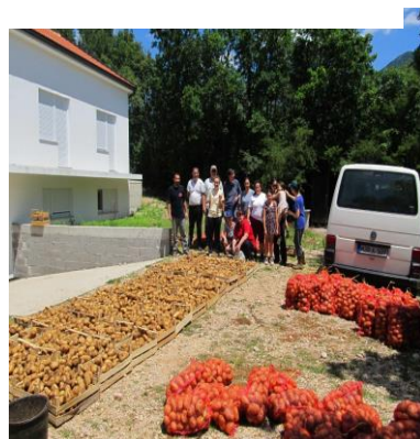
Harvesting Potatoes at Church Field