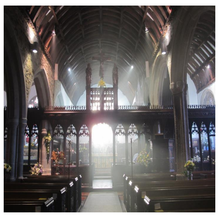
St Andrew's Early Easter Morning 2011

With best wishes, love and prayers from us all here in Stratton.