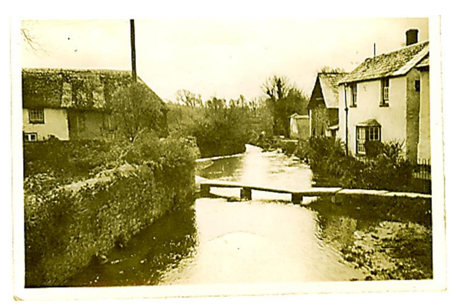
Clapper Bridge C 1934