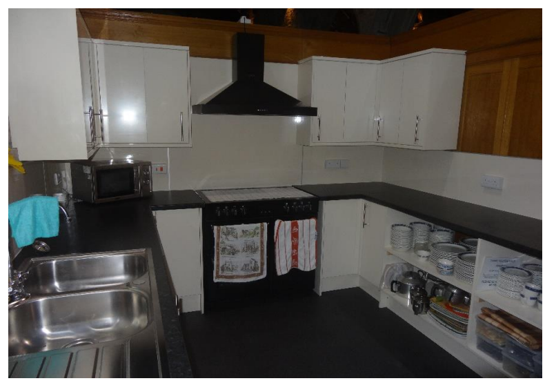
The kitchen complete and in use.

It was now possible to take the final as-built dimensions for the extended new kitchen enclosure and so agree a final kitchen layout and obtain quotations. With everything agreed the instruction to go ahead with the kitchen installation was given. The 1<sup>st</sup> fix electrical work began in October, followed by the installation of the kitchen units, then the final fix electrics and plumbing, the new floor finish and finally the new cooker and fridge/freezer.